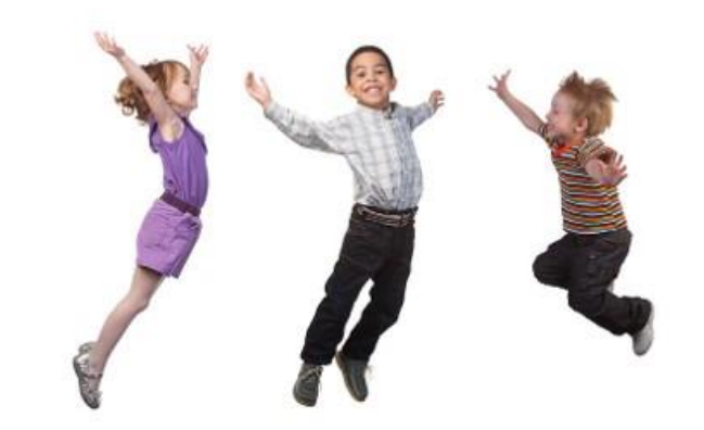
Child Development 0-5