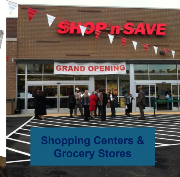
Shopping Centers & Grocery Stores