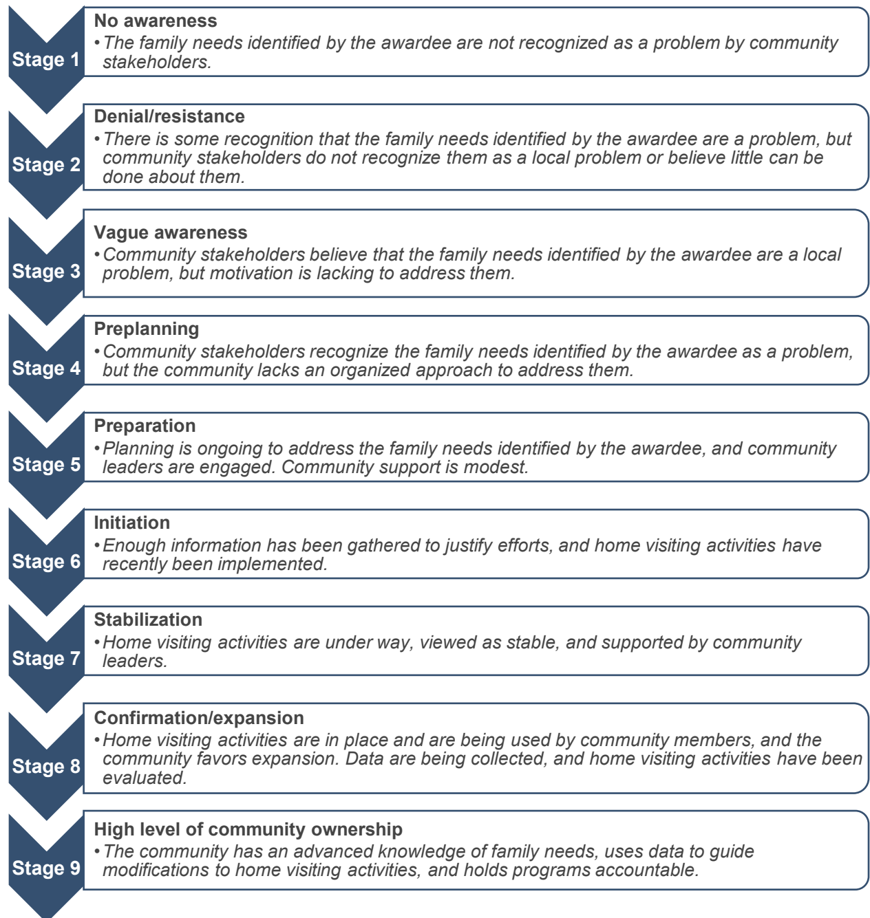
Exhibit 7. Stages of Community Readiness