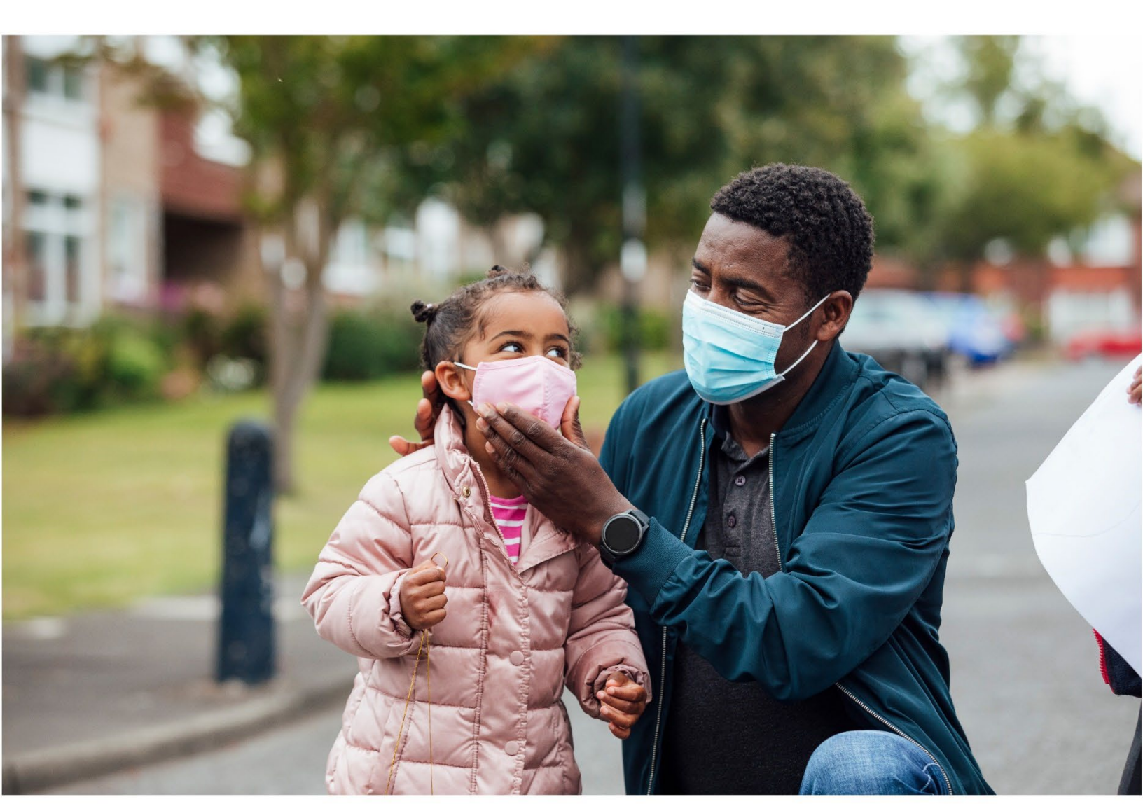
OPRE Report 2023-11

Lessons Learned and Promising Practices During the COVID-19 Pandemic